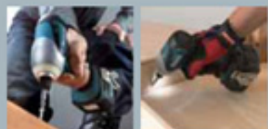
Fast Charger, Battery Cartridge (2pcs), Philips Bit