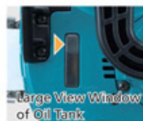
Large View Window of Oil Tank

Oil tank contains enough amount of chain oil required for work amount on a single full battery charge.