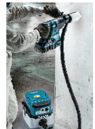
Photo : DHR280 & DX08