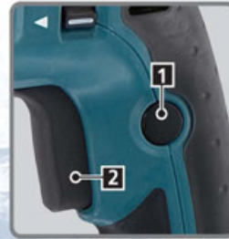
1 Lock-On Button for Continuous Operation 2 Variable Speed