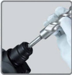
One-Touch Sliding Chuck for Easy Bit Changes