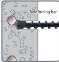
Torque Limiter :: When drill bit hits against reinforcements, Torque Limiter operates to stop.