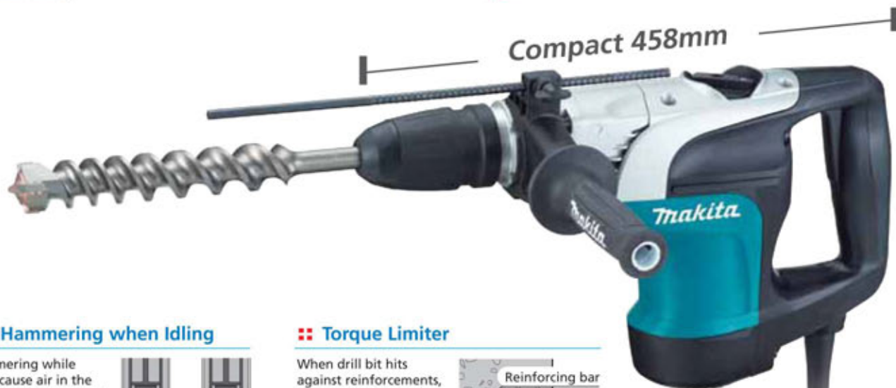
Slide-back and Pull