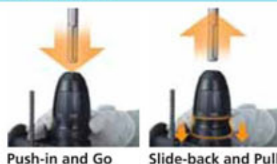
Push-in and Go