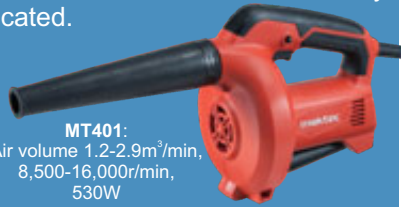
MT401: Air volume 1.2-2.9m 3 /min, 8,500-16,000r/min, 530W

The Maktec MT401 Blower has an in-line and ergonomically designed grip for easily applying the nozzle to the target to be blown away. It is lightweight at only 1.5kg and the speed control dial is conveniently located.