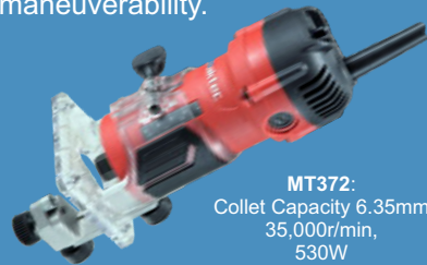
MT372: Collet Capacity 6.35mm 35,000r/min, 530W

The Maktec MT372 Trimmer has a transparent base for clear view of trimming area and sight line. The tool is lightweight with high maneuverability.